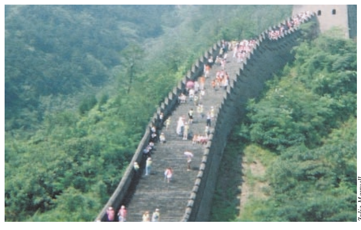
NESMS pupil spent her 15th birthday exploring the Great Wall of China