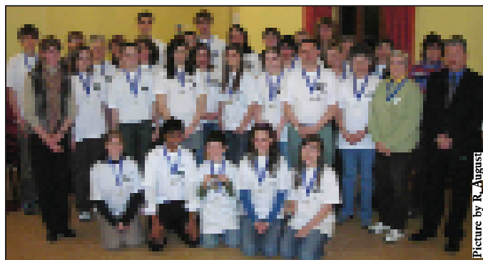
The successful Grade-1-athoners

The event, on 19th November last year, was the first time that the fund raising concept had been tried in Scotland. The Grade-1-athon