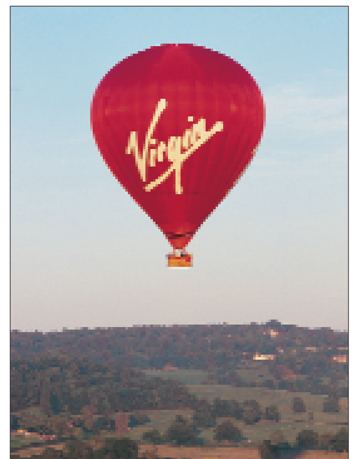
One of the auction lots this year is a hot air balloon flight with Virgin Balloons. The flight has been donated by Dales Engineering Services Ltd. Peterhead.